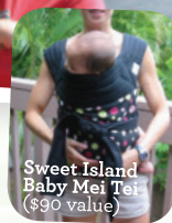
Sweet Island Baby Mei Tai ($90 value)