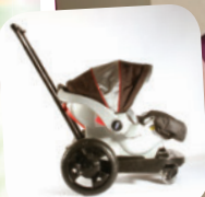
Go-Go Babyz Infant Cruiser ($149 value)