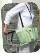
Baggino ($149 value)