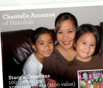
Stacy's Creations 100 invitation/ announcements ($100 value)