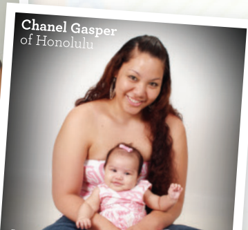
It's Mine! Personalized Plush Blanket and Burp Cloths ($105 value)